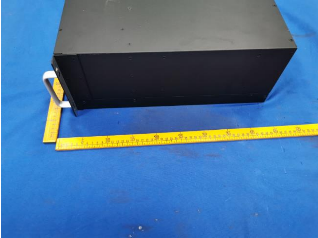
样品图片 (Sample photograph) -6