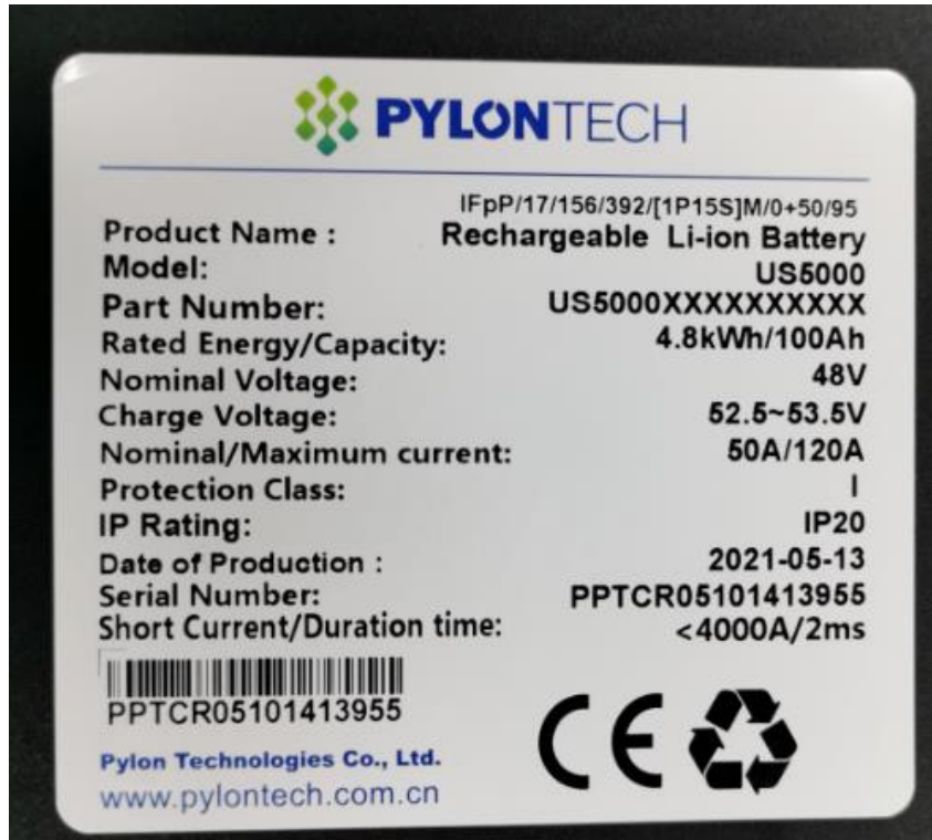
样品图片 (Sample photograph) -8