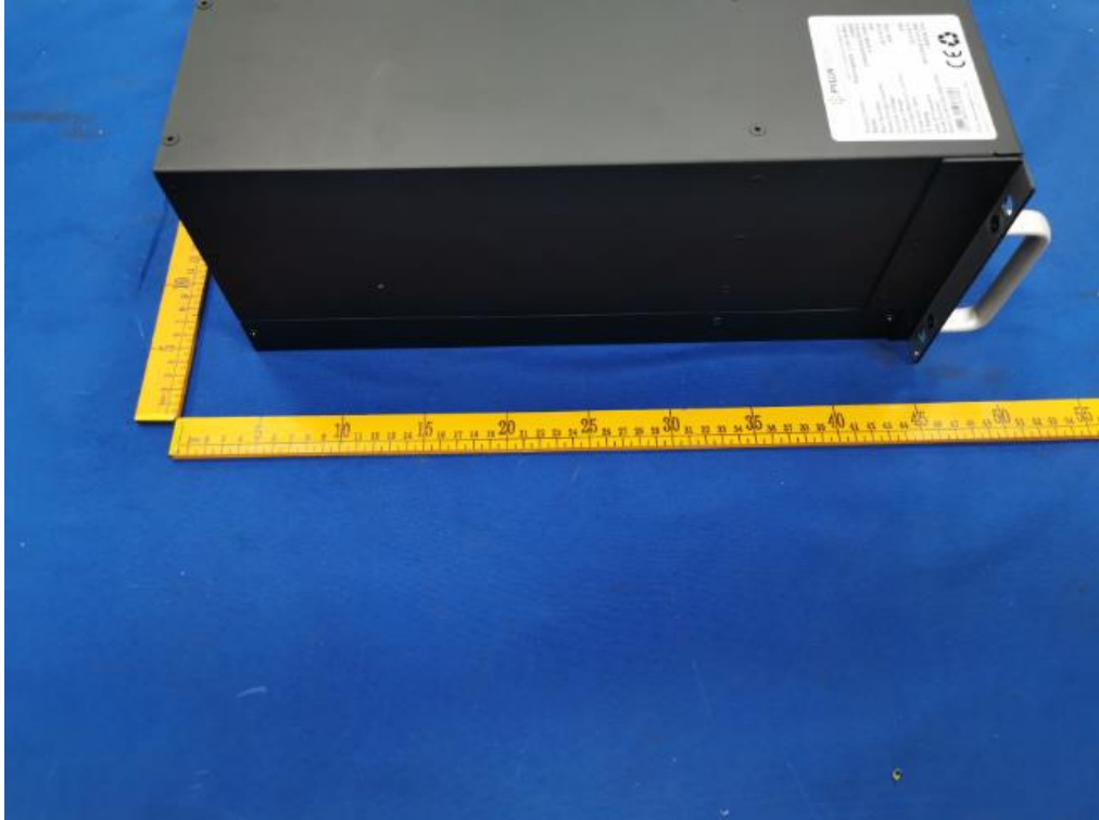
样品图片 (Sample photograph) -4